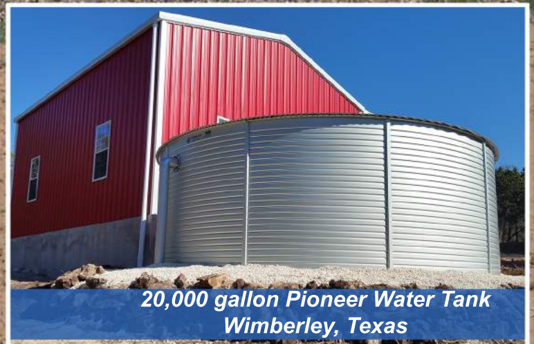
20,000 gallon Pioneer Water Tank Wimberley, Texas